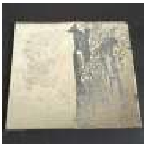
Copper No Copper