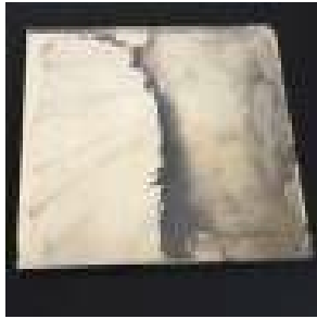
Copper No Copper