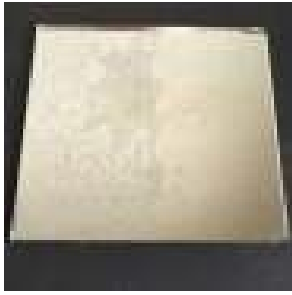
Copper No Copper