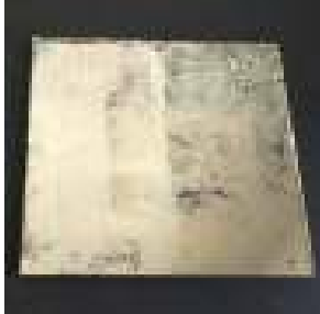
Copper No Copper