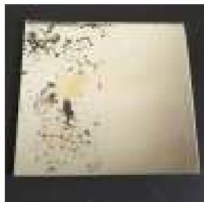
Copper No Copper