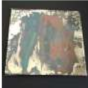
Copper No Copper