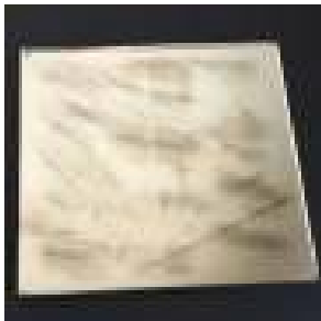
Copper No Copper

PUMICE is a fine abrasive used to thin or remove the silver by buffing.